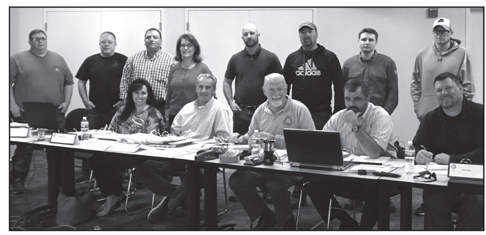
Union Negotiators met 16 times with Eversource management before reaching a contract agreement to bring to the membership for a vote.

IBEW 1837 members at four of our represented companies negotiated and voted to ratify contract agreements in 2017.