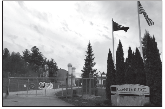
Workers at Granite Ridge Energy first voted to join IBEW Local #1837 in a National Labor Relations Board election in 2006.