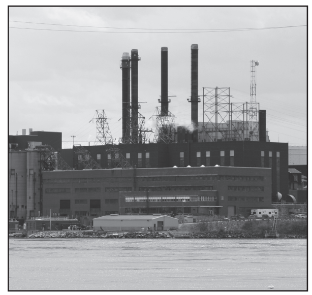
Union members at fossil generation facilities including Schiller Station who are affected by the divestiture are eligible for additional benefits under the terms of the agreement reached between Eversource and the IBEW Local #1837.

the Company to sell them if it was in the "economic interest" of ratepayers. PSNH had been under pressure to sell in large part because costs associated with a state-mandated "scrubber" to reduce mercury emissions at Merrimack Station had led to substantial upward pressure on residential electric rates.